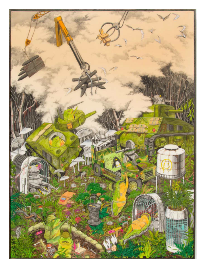
Hun Kyu Kim, Draft of Porco Rosso, 2017. Pigment on silk, 120 x 90 cm.