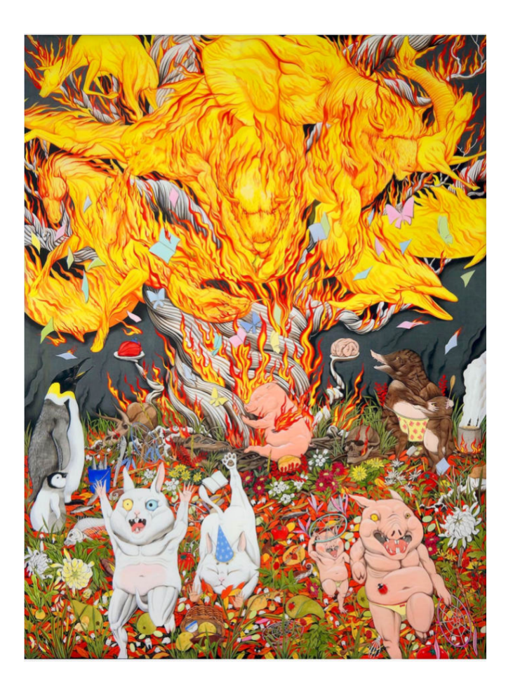
Hun Kyu Kim, Don't be afraid, my love. Pigment on silk, 140 x 100cm, 2016. Courtesy of the artist and High Art.