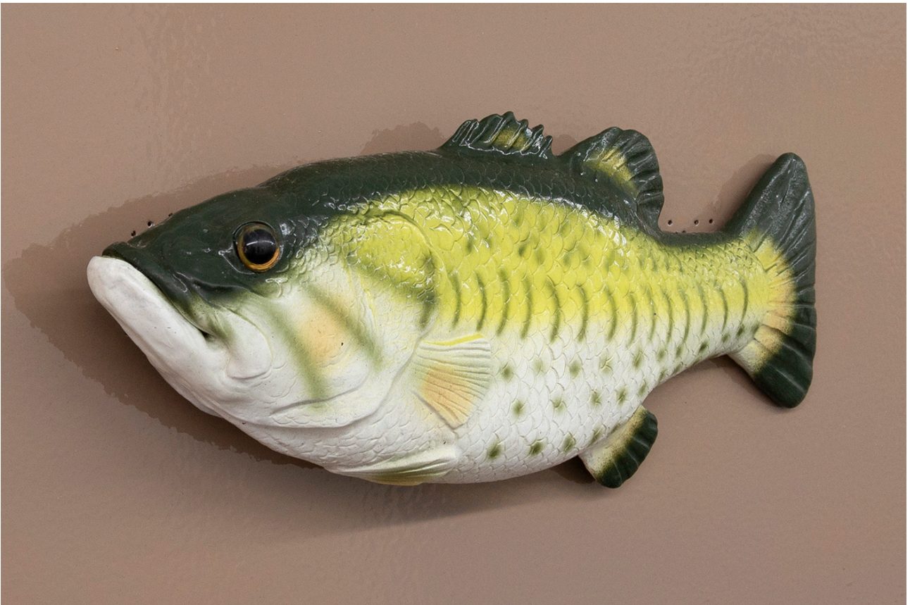
Dena Yago, Trawler (installation view and detail), 2020. Audio, wood, enamel, Big Mouth Billy Bass, 30 x 27 1/2 x 5 1/2 in. Installation view, Dry Season , Bodega, New York, September 12–October 24, 2020. Courtesy of the artist and Bodega, New York.