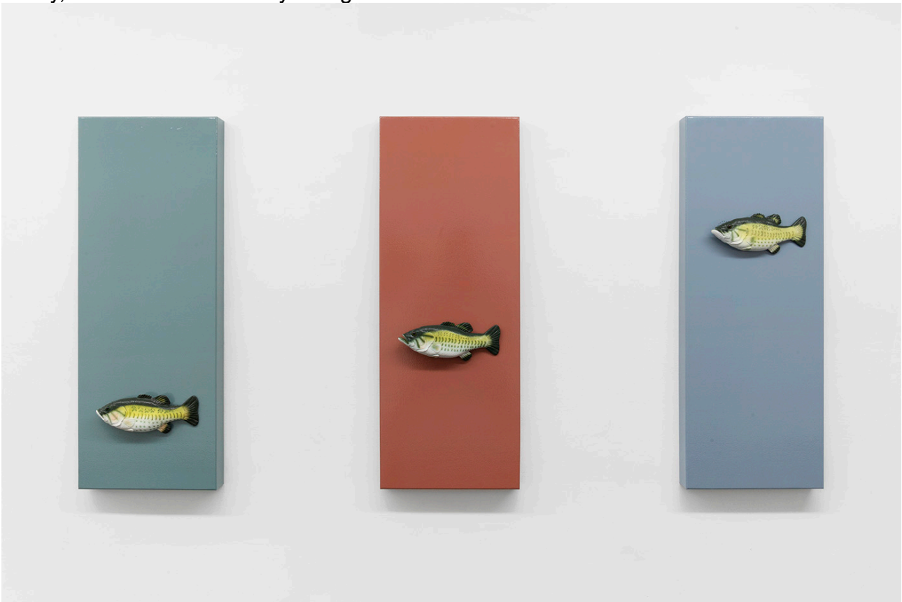
Left to Right: Dena Yago, Pitcher , 2020, audio, wood, enamel, Big Mouth Billy Bass, 48 x 24 x 5 1/2 in.; Chum , 2020, audio, wood, enamel, Big Mouth Billy Bass, 48 x 24 x 5 1/2 in.; Pleader , 2020, audio, wood, enamel, Big Mouth Billy Bass, 48 x 24 x 5 1/2 in. Installation view, Dry Season , Bodega, New York, September 12–October 24, 2020.

to its still position. The violent erectness with which the flaccid trophy fish performed led me to believe that this full-body movement was seen as so appealing by its creator due to a latent anxiety, intuited or perceived, surrounding erectile dysfunction and decreased virility among Boomer men. All of these fathers and uncles were inviting their colleagues, family, and friends to walk by and gawk at an animatronic semi.