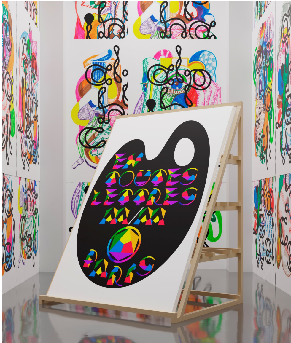
Exhibition project for Air de Paris © M/M (Paris) and Air de Paris, Romainville. Courtesy of the artists and Air de Paris.