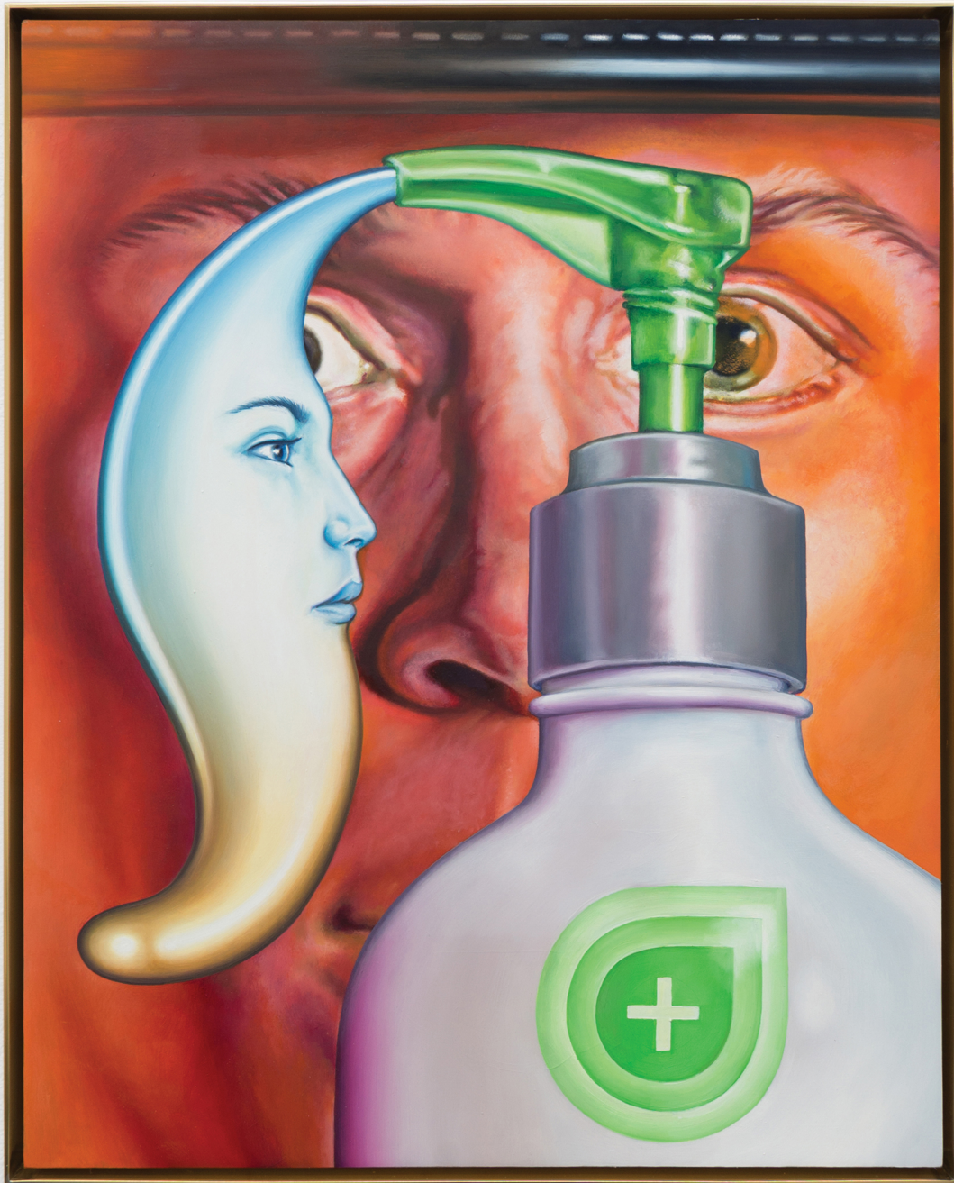
Eczema Song II , Oil on linen, bronze frame, 20 x 16 in