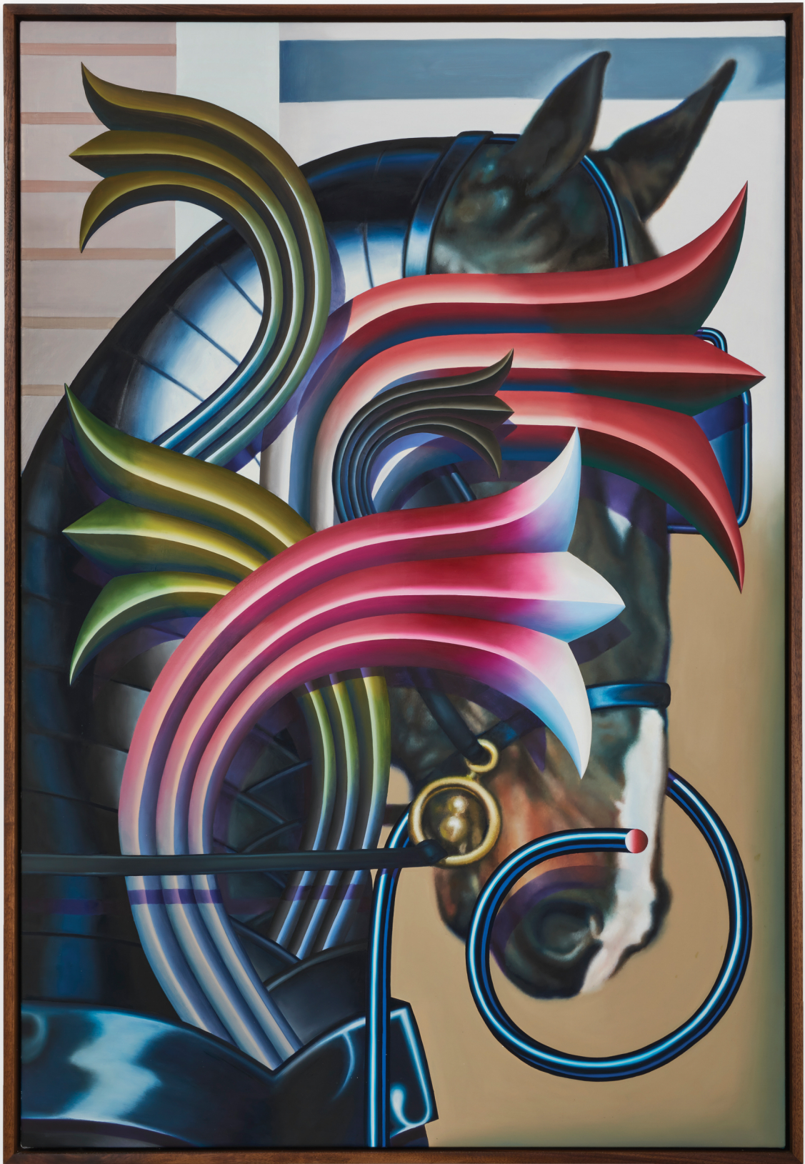
Lucy Teacher Tether Whip , Oil on canvas, walnut with mother of pearl inlay frame 35.3 x 51.5 x 2 in