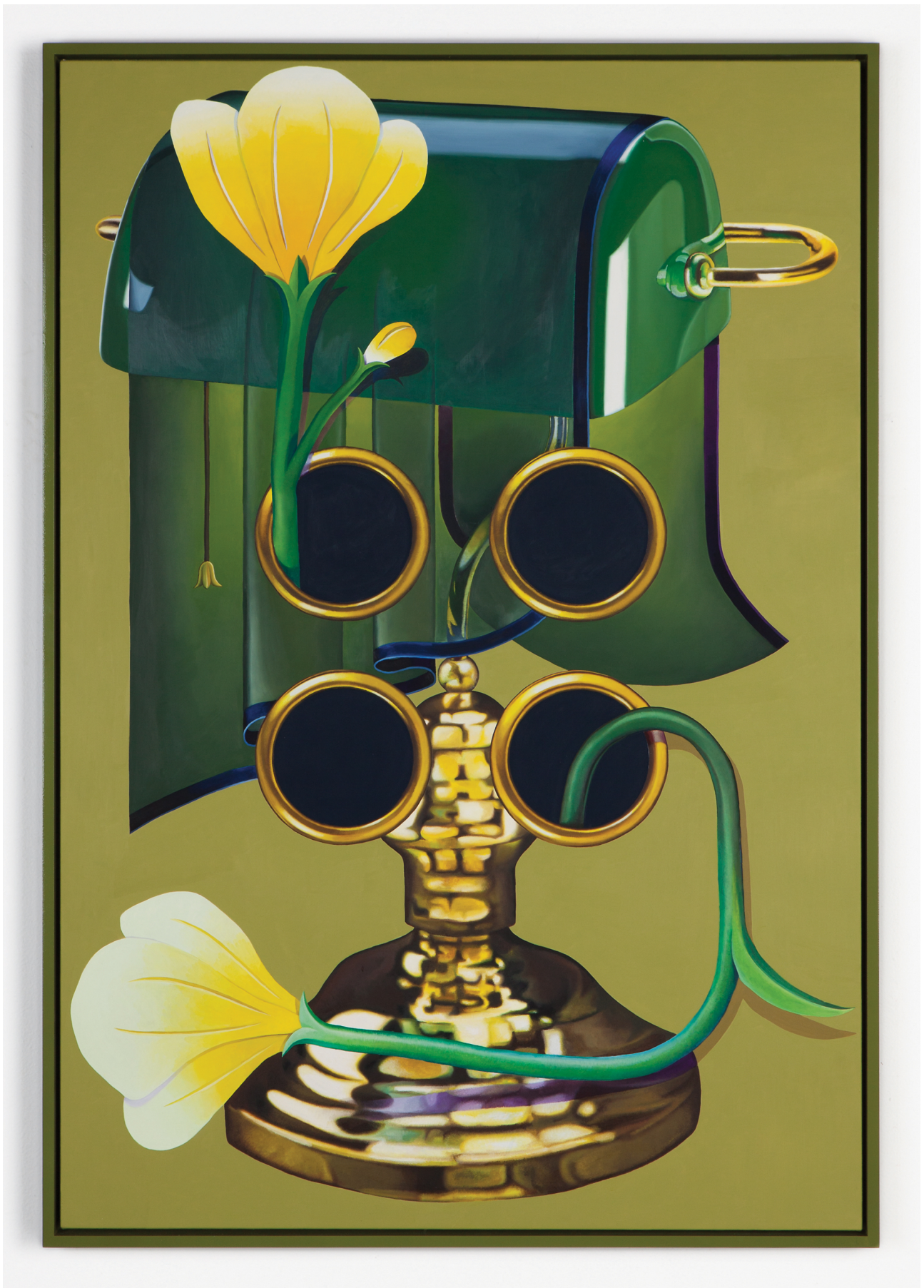
Bakers Steak , Oil on canvas, 35.5w x 51.5h in.