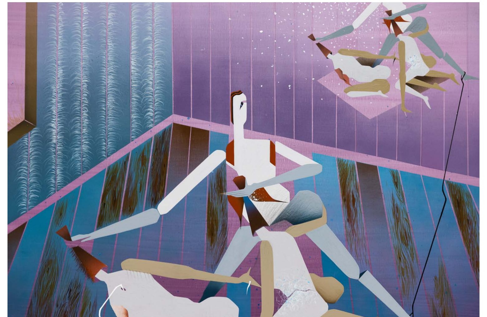
Below: Maryam Hoseini. Anxiously One on One . 2022. Detail. Acrylic, ink and pencil on wood panel. 101.6 x 76.2 cm.

a key theme in Hoseini's work and its exploration is central to her worlds, both internal and external.