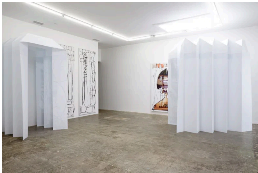
Aaron Garber-Maikovska, Sidesteps and Outlets (installation view) (2015).