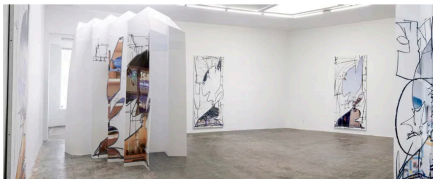
Aaron Garber-Maikovska, Sidesteps and Outlets (installation view) (2015).