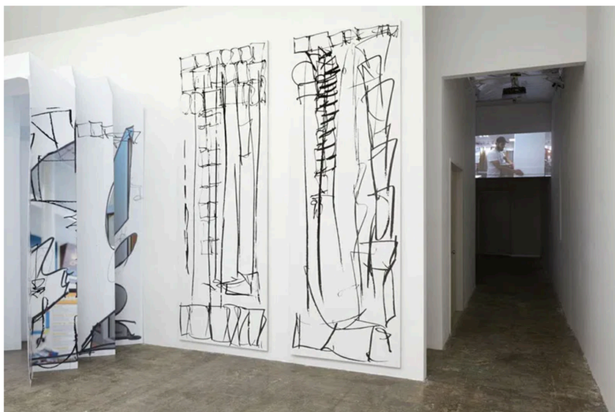
Aaron Garber-Maikovska, Sidesteps and Outlets (installation view) (2015).